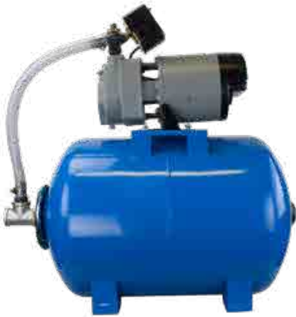
JHU05AT44H, JHU07AT44H Convertible Systems