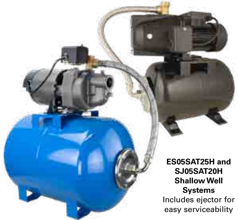
ES05SAT25H and SJ05SAT20H Shallow Well Systems Includes ejector for easy serviceability